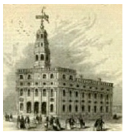
In late 1845, the top floor of the released him.<sup>11</sup> temple was dedicated in preparation for ordinances.